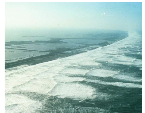
Nonlinear water waves off the coast of North Carolina during the Perfect Storm of 1991, a subject studied using advanced mathematical tools.