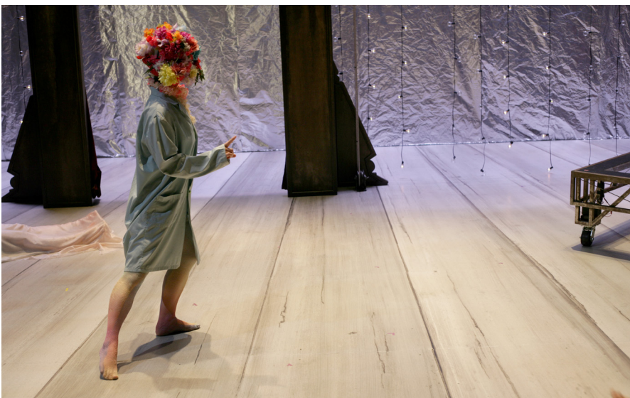
Cold Empty Terrible production

The Undergraduate Theater Society (UTS) is an ASUW-sponsored student organization that supports undergraduate student productions. UTS annually produces a season of five plays specifically with and for undergraduates in the Cabaret Theatre in Hutchinson Hall. UTS also organizes quarterly workshops with guest artists and a new works festival.