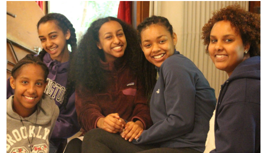
Making Connections students at the 2016 Leadership Retreat.

The Re-Entry program is a free service available to individuals considering returning to school after a significant time away. Many participants have been through life-changing experiences and are in search of a career change that requires them to seek educational training in a new field. The program provides support and counseling during the application process and offers assistance for students in their academic pursuits after their acceptance. Additional programming includes an annual day-long orientation helping returning students acclimate to university life. Guest speakers include former Re-Entry students and representatives from many UW programs.